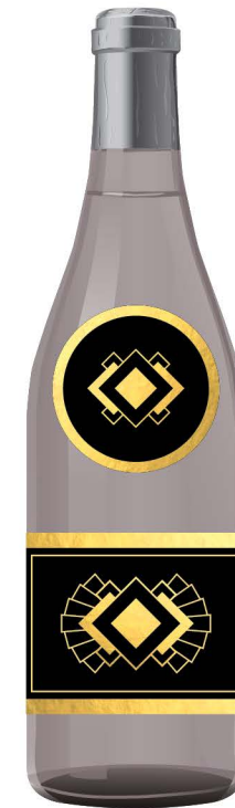
Bottle Neck Decor*